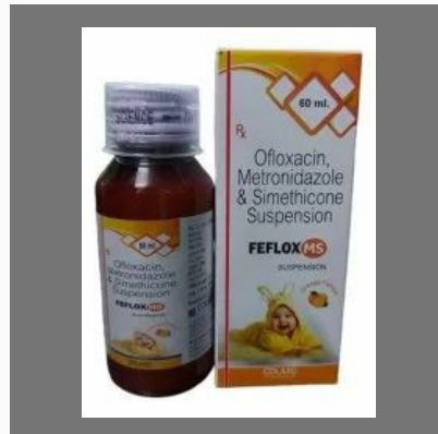
Ofloxacin Metronidazole Simethicone Suspension