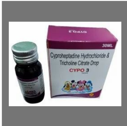
Cyproheptadine Hydrochloride Tricholine Citrate Drops