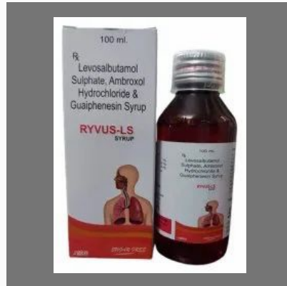
Levosulbutamol Sulphate Ambroxol Hydrochloride Guaiphenesin Syrup