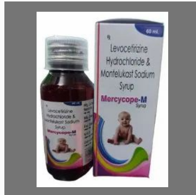
Levocetirizine Hydrochloride Montelukast Sodium Syrup