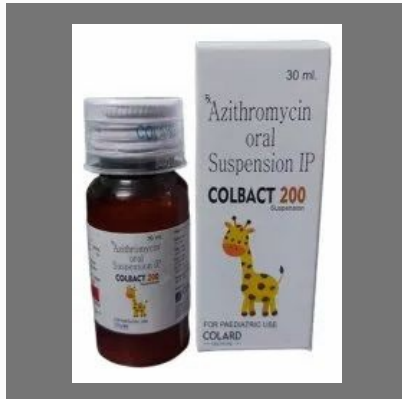
Azithromycin Oral Suspension IP