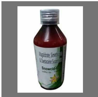
Magaldrate Simethicone Oxitacaine Suspension