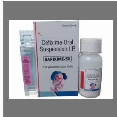
Cefixime Oral Suspension IP Syrup